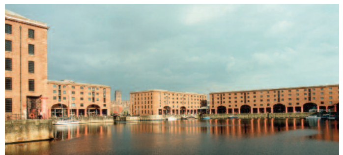
Albert Dock, Liverpool

Liverpool is partner in the HerO network and EAHTR member city