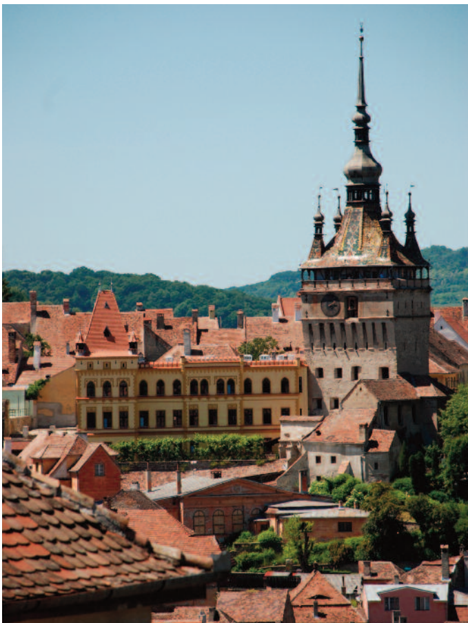
The Citadel of Sighișoara, Romania

Published: January 2010 by the City of Regensburg, Planning and Building Division, World Heritage Management, Neues Rathaus, D.-Martin-Luther-Str. 1, 93047 Regensburg, GERMANY, Phone: +49 (0) 941/507-1768, Fax: +49 (0) 941/507-4619, E-mail: hero@regensburg.de Printed copies: 750; Print: Erhardi Druck, Regensburg (GERMANY)