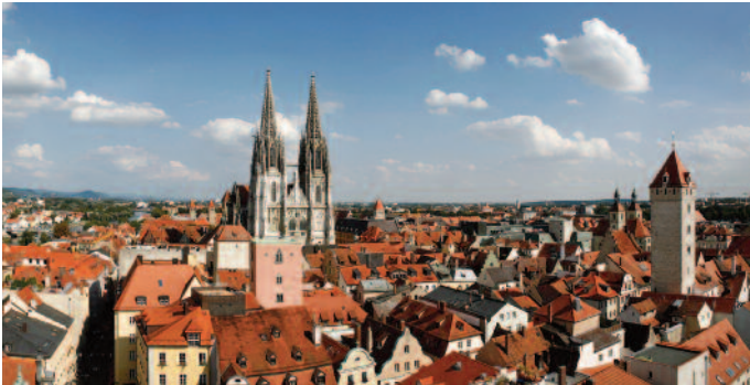
The Old Town of Regensburg, Germany

The HerO partner cities are Regensburg (Germany, Lead Partner), Graz (Austria), Naples (Italy), Vilnius (Lithuania), Sighișoara (Romania), Liverpool (United Kingdom), Lublin (Poland), Poitiers (France) and Valletta (Malta).