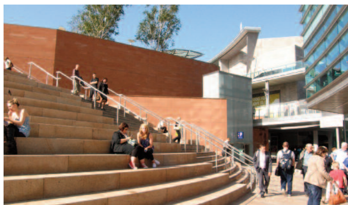
Liverpool ONE, a shopping, residential and leisure centre in Liverpool city centre, opened in 2008

We therefore call on the European commission to promote integrated urban development approaches as a central requirement of all EU and national policy for urban areas.