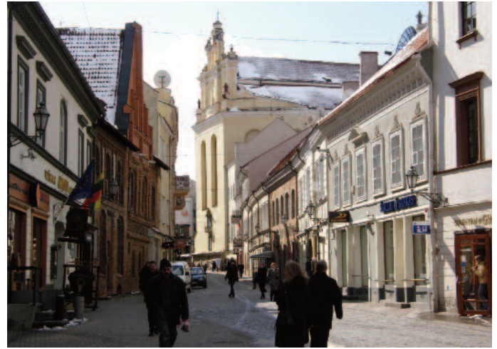
Pilies Street in Vilnius, Lithuania

We therefore call on the European Commission, in supporting integrated urban development based on urban heritage assets, to also ensure the integration of European Funding Programs and National Funding Programs. In doing so complementary use of different funding schemes should be made possible for urban cultural heritage.