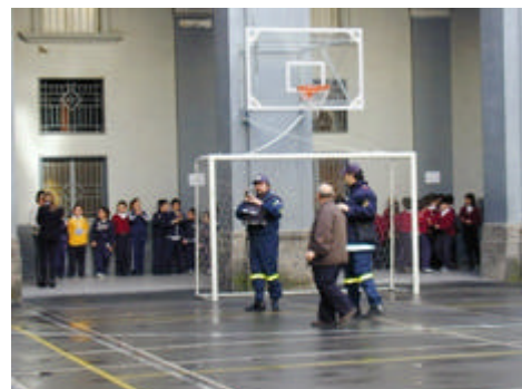
MUNICIPALITY OF NAPLES - INTERNATIONAL INSTITUTE STOP DISASTERS, 2008

Information campaigns are promoted on specific risks: Industrial, seismic, etc.