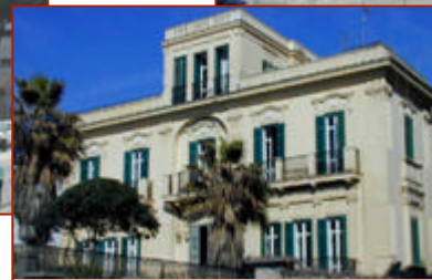
Villa Medusa (Bagnoli)