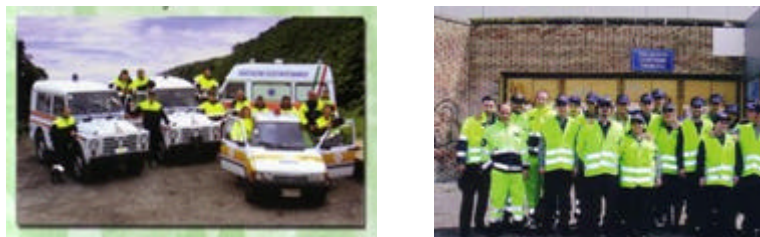
MUNICIPALITY OF NAPLES - INTERNATIONAL INSTITUTE STOP DISASTERS, 2008

The Municipality also promote NOEMs training to raise their ability for intervention, co-ordination, and their professional and technological skills.