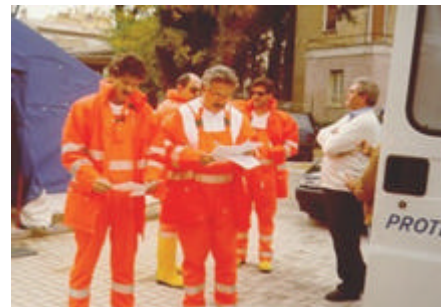
MUNICIPALITY OF NAPLES - INTERNATIONAL INSTITUTE STOP DISASTERS, 2008