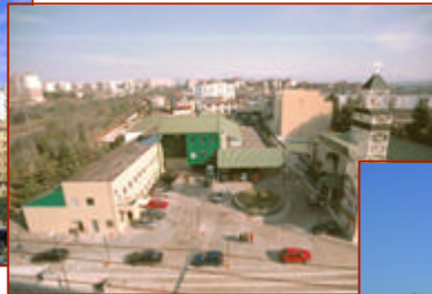
Centro Polifunzionale di Cupa Principe