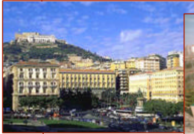
HEADQUARTERS Palazzo San Giacomo, Piazza Municipio

More information: http://www.comune.napoli.it/protezionecivile