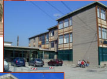
Ex scuola 'G. Deledda'