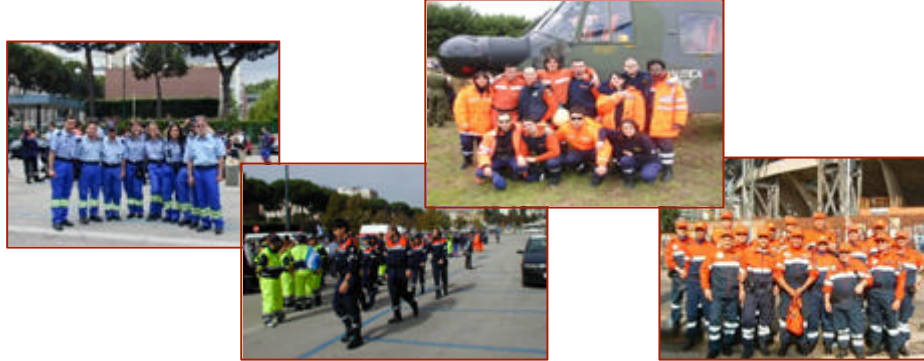
MUNICIPALITY OF NAPLES - INTERNATIONAL INSTITUTE STOP DISASTERS, 2008

Over 800 self-sufficient Volunteers support the emergency management and the assistance to the population, both in prevention than in the emergency phases, as well as during the organization of important events ('grandi eventi')