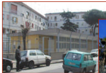
Struttura Rione Forzati